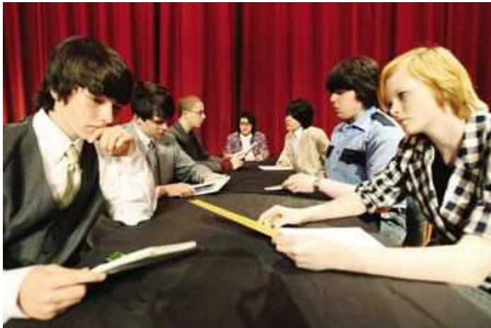
The Boardroom of Mikado Enterprises, LLC.